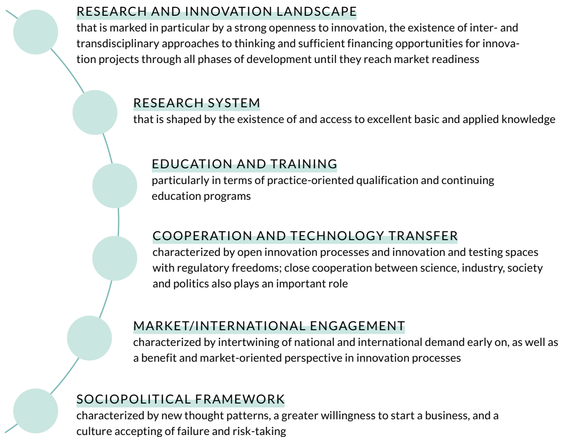
FIGURE 1 DIMENSIONS OF THE INNOVATION PROCESS